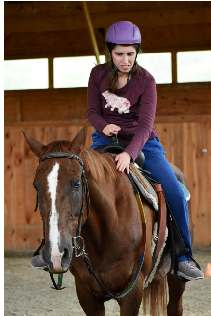
Rachel giving Montana some "good boy" pets