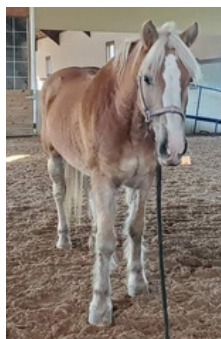
April 10th Happy 24th Birthday, Elsa!